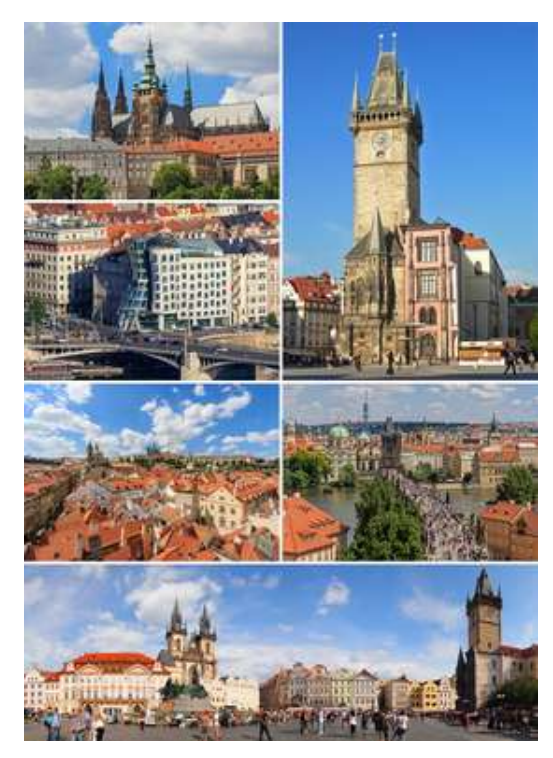
Montage of Prague.

From its founding to the present the Institute provides a complex base for aero medical training of Air Force pilots, parachutists and divers. Today's IAM in Prague has become a leading diagnostic, clinical and assessing medical facility for both civil and military flying personnel. It includes a host of clinical departments (internal, ENT, ophthalmology, neurology, radiodiagnostic, surgery, psychiatry and psychology, dentistry and clinical physiology) and employs modern diagnostic and training technologies (ex. night vision training, hypobaric and hyperbaric chambers, Lower Body Negative Pressure, Gyro IPT II, flight simulator TL- 39). These facilities can also be available for use by other government and non-government organizations for their own particular training needs".