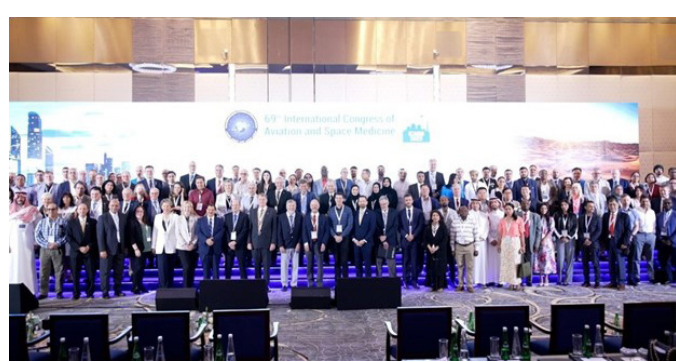
Attendees at the Congress.

The hospitality and professionalism of the ICASM 2023 team and UAE hosts were outstanding. There were many international speakers, including a significant number of current