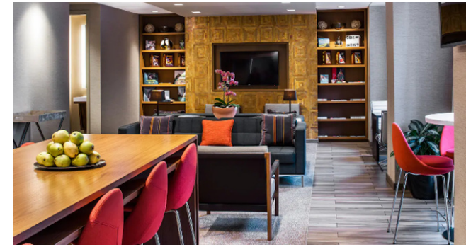
Hyatt Regency Chicago Regency Club