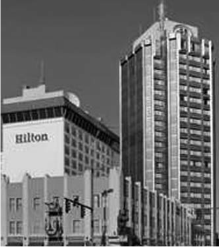
IOTELS---(left to right) Marriott, Cook, Hilton and Westmark, Each