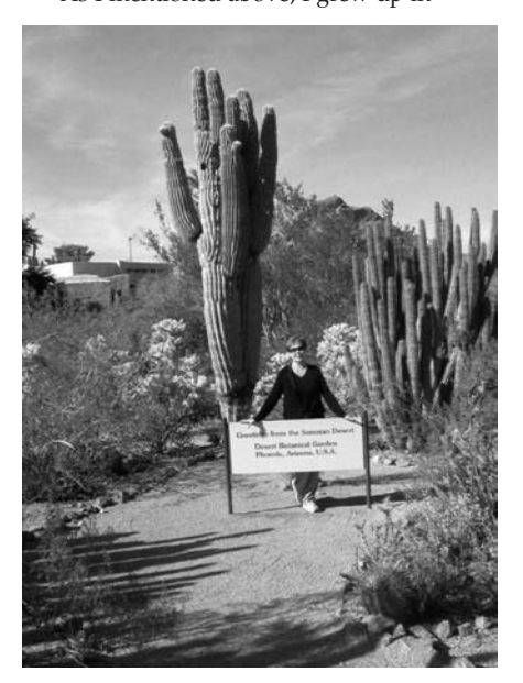
GREETINGS FROM THE SONORAN DESERT- Dale Orford at the Desert Botanical Garden, Phoenix, AZ.