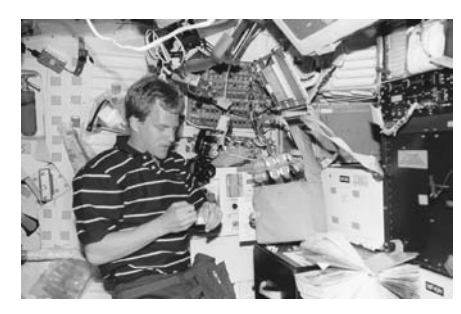
FIG. 4. Author (Dr. Scott Parazynski) dispensing medications on orbit.

Regardless of the support schedules, Private Medical Conferences (PMCs) are regularly scheduled between the SURGEON and the onboard CMO. These conferences are held daily for Shuttle crew and weekly for ISS crews. In case of an emergency, PMCs can be called at any time by the crew or those in MCC. The PMCs are conducted over a twoway private Space-To-Ground audio link. If conditions warrant, electrocardiographic tracings or high resolution video may be downlinked for medical case management. Depending on the experience level of the CMO, varying degrees of real-time consultation may be required to manage an onboard clinical issue. Routine intervention of intramuscular Phenergan for space adaptation syndrome or dispensing of Motrin for back discomfort would most likely be accomplished without SURGEON consultation. Instead, the CMO would simply report these events within the daily PMC. A more significant intervention, such as treatment of urinary retention, would be discussed with the SURGEON via a special request PMC.