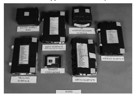
FIG. 1. Shuttle Medical Kit.

A collaborative, team-based approach to medical care is employed for both short duration Space Shuttle and long duration ISS missions. Ground support schedules vary based