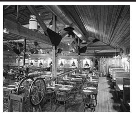
SOURDOUGH MINING COMPANY --Interior dining room view. For more information, see: # http://www.alaskaone.com/aksourdough/