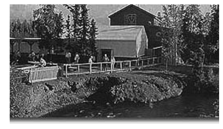
SOURDOUGH MINING COMPANY- Outside view.

Sign up information will be available at the Society's information table. SEE YOU THERE!