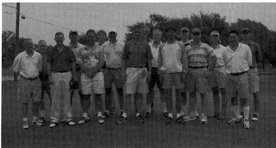
GOLF TOURNAMENT --Members and friends played a 4 man/woman scramble tournament at Brooks City-Base golf course, on Sunday May 4, 2003. The tourney was sponsored by Wyle Laboratories, and the trophies were awarded at the end of the event.