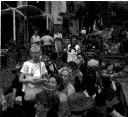
BOAT TOUR-- Wing members heading down the San Antonio River.

That will be a great weekend, for in addition, and purely coincidentally, another family is gathering from LA for the Graduation of their son at San Marcos, just up the road, on Saturday 10th and we are thrilled that we are able to attend the ceremony.