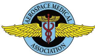
The old AsMA Logo with the Staff of Hermes.

The Aerospace Medical Association (AsMA) Council approved a revised AsMA logo during the November 15, 2017, meeting in Alexandria, VA. This approval culminated a 2-year process to review the AsMA logo and update it to ensure the symbology associated with the AsMA logo was accurate and truly represented the association's focus on aviation and space medicine.