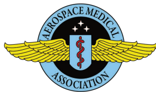
The new AsMA Logo with the Rod of Asclepius.

During the May 10, 2015, AsMA Council Meeting, the AsMA President (Dr. Phil Scarpa) presented a proposal to change the official AsMA logo. This proposal was based upon a significant difference identified between the caduceus (Staff of Hermes) and the Rod of Asclepius. The Staff of Hermes is currently used within the official AsMA logo. The Staff of Hermes is depicted as a stick entwined by two snakes with surmounted wings. It is the symbol of modern medicine in India and elsewhere. Most major hospitals, medical colleges, clinics, professional bodies, prescriptions and medical journals support this symbol either as an emblem or as part of their logo. The car windshields of many doctors feature this symbol prominently as a badge of prestige and honor. But, unfortunately, the very emblem we flaunt as an insignia of our medical profession is a false symbol and has nothing or very little to do with the noble art of healing. The true and authentic symbol of Medicine is not the Caduceus but the Rod of Asclepius.