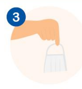
Fold outside corners together